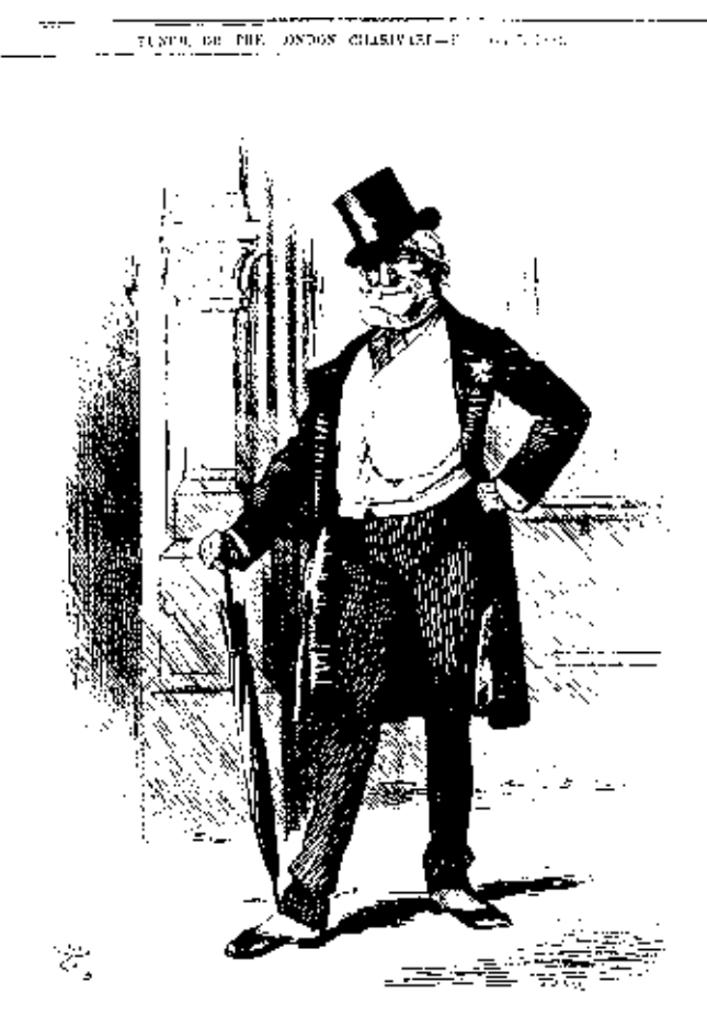
"RETIRE!-WHAT DO YOU THINK?"