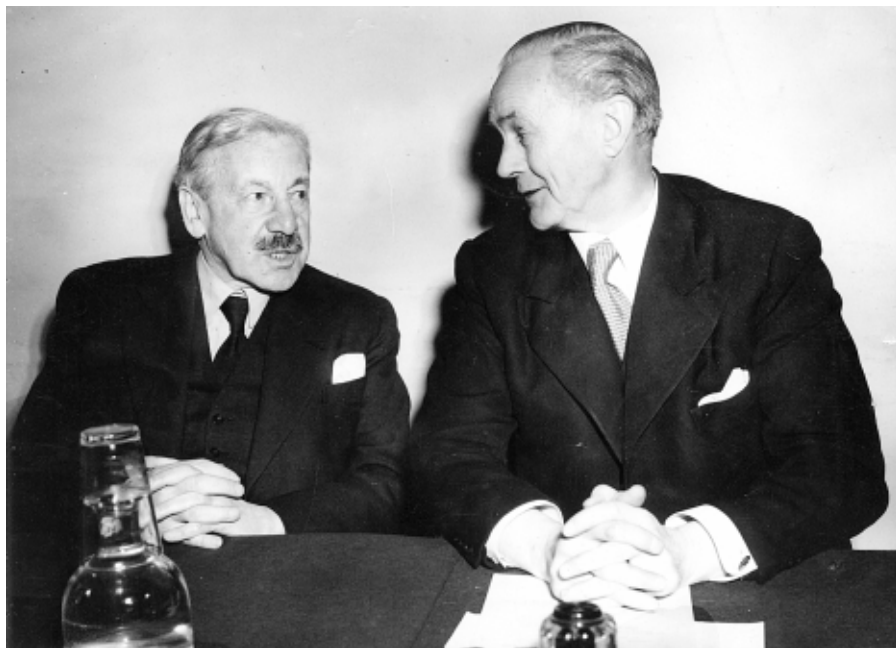
Clement Davies with Lord Samuel, Liberal leader 1931–35

the Leader of the Opposition in the event of either of them being called upon to form the next Government. If either a Labour or a Conservative Prime Minister wished to broaden the base of his administrations the Parliamentary Liberal Party would at that time decide its course of action in the normal constitutional way. 72