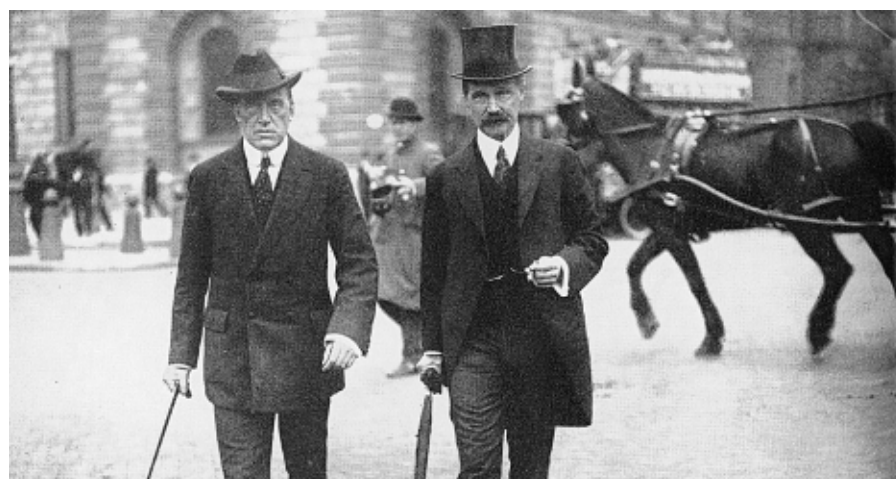
Unionist leaders: Sir Edward Carson and Andrew Bonar Law

Before the success or failure of this approach could be tested, the outbreak of war deflected attention on to European affairs. But failure should not automatically be assumed. Facing the