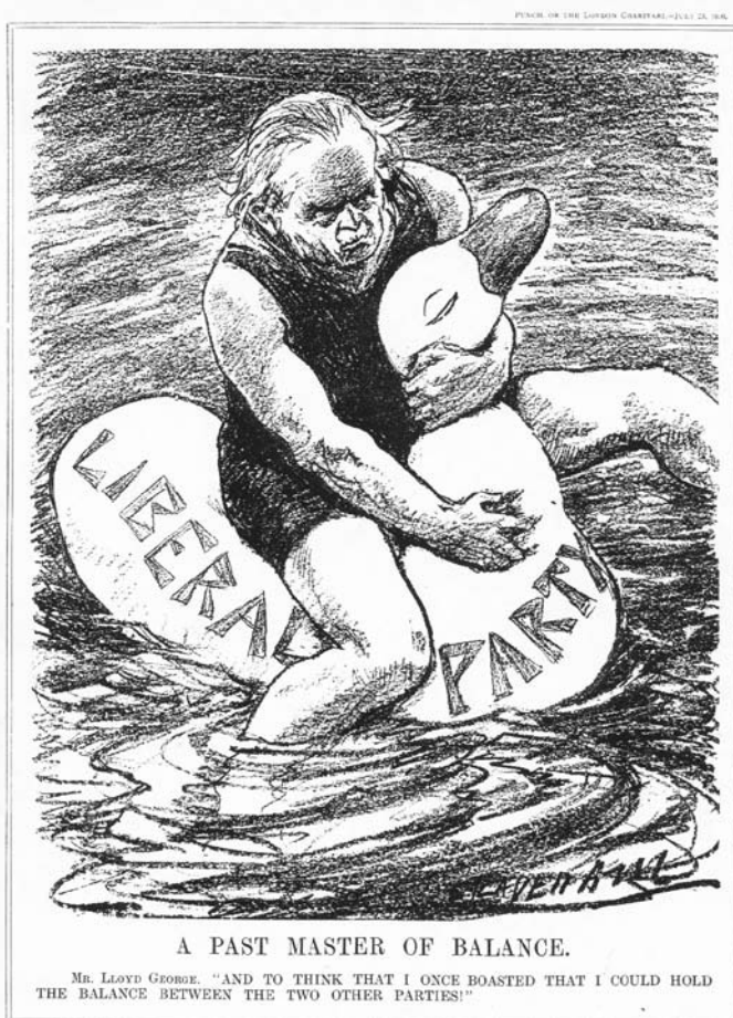
The dangers of holding the balance: Punch , 30 April 1924 and 23 July 1930.

The fact that moderate Labour and radical Liberalism overlapped at so many points was not, in the Labour view of things, a reason for the re-establishment of the pre-war Progressive Alliance; it merely confirmed the good sense of those Liberals who had already transferred their allegiance to Labour. 'The only kind of co-operation which is possible', MacDonald told Gilbert Murray, 'is the co-operation of men and women who come over and join us.' 22 MacDonald fully understood that there was not room in the political spectrum for two parties of the progressive left and, if only one could survive, he was determined that it should be Labour. If Liberalism could be held down long enough, the built-in bias of the electoral system would eventually work against it. By contrast, the granting of proportional representation would guarantee it a solid base in parliament for the foreseeable future, while depriving Labour of any prospect of an independent Commons majority. The short-term price of this strategy